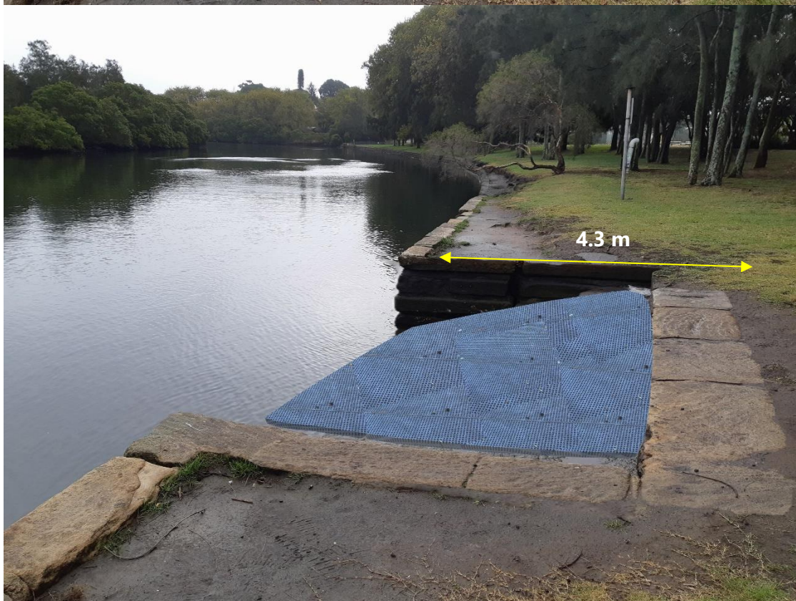
Top – Existing view of launching area. Bottom – Artist impression of launching area with FRP panels, slope 1V:4H