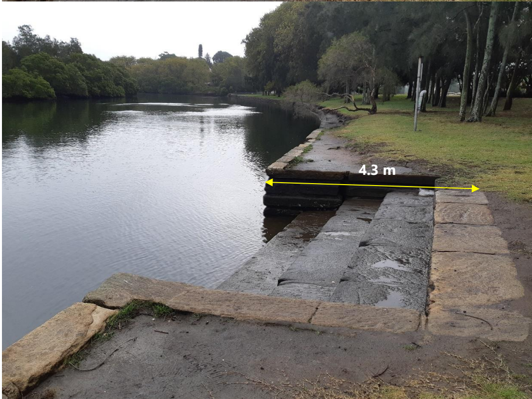
Top – Existing view of launching area. Bottom – Proposed substructure lengthened to 4.3 m