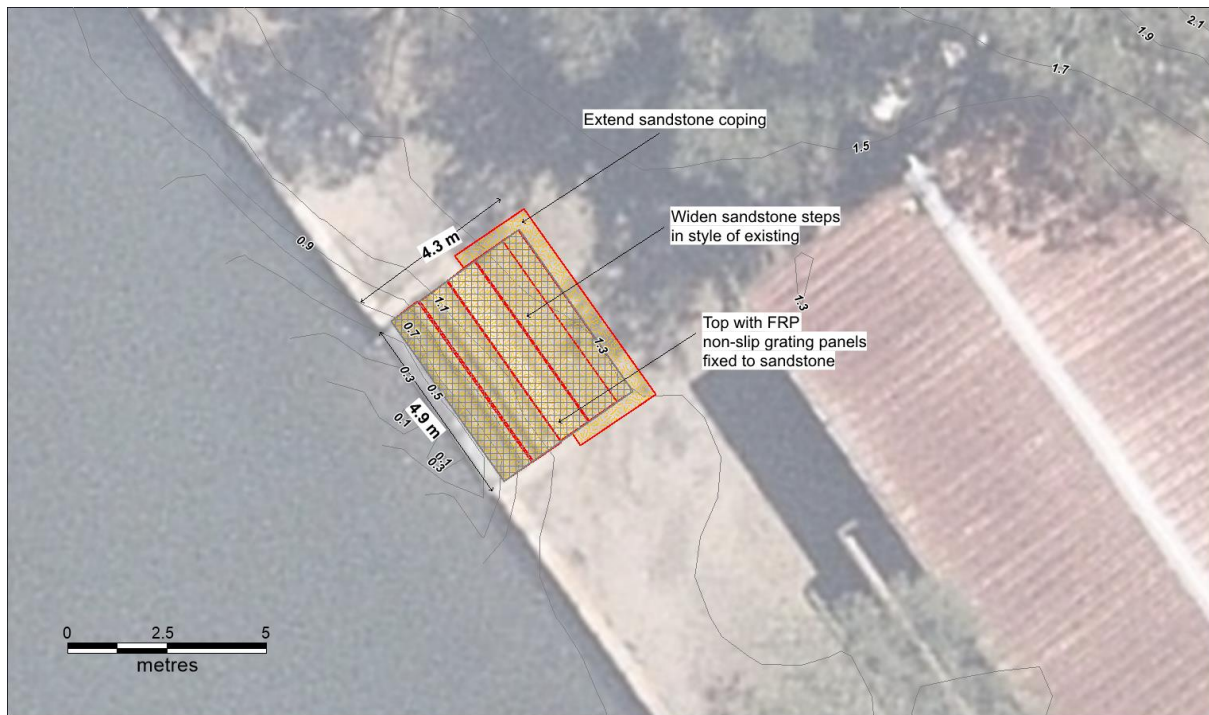
Plan view of proposed upgrade, widened sandstone steps with FRP panels. Contours from Spatial Services, Department Finance, Services and Innovation, 1 m Digital Elevation Model derived from LIDAR, April 2013.